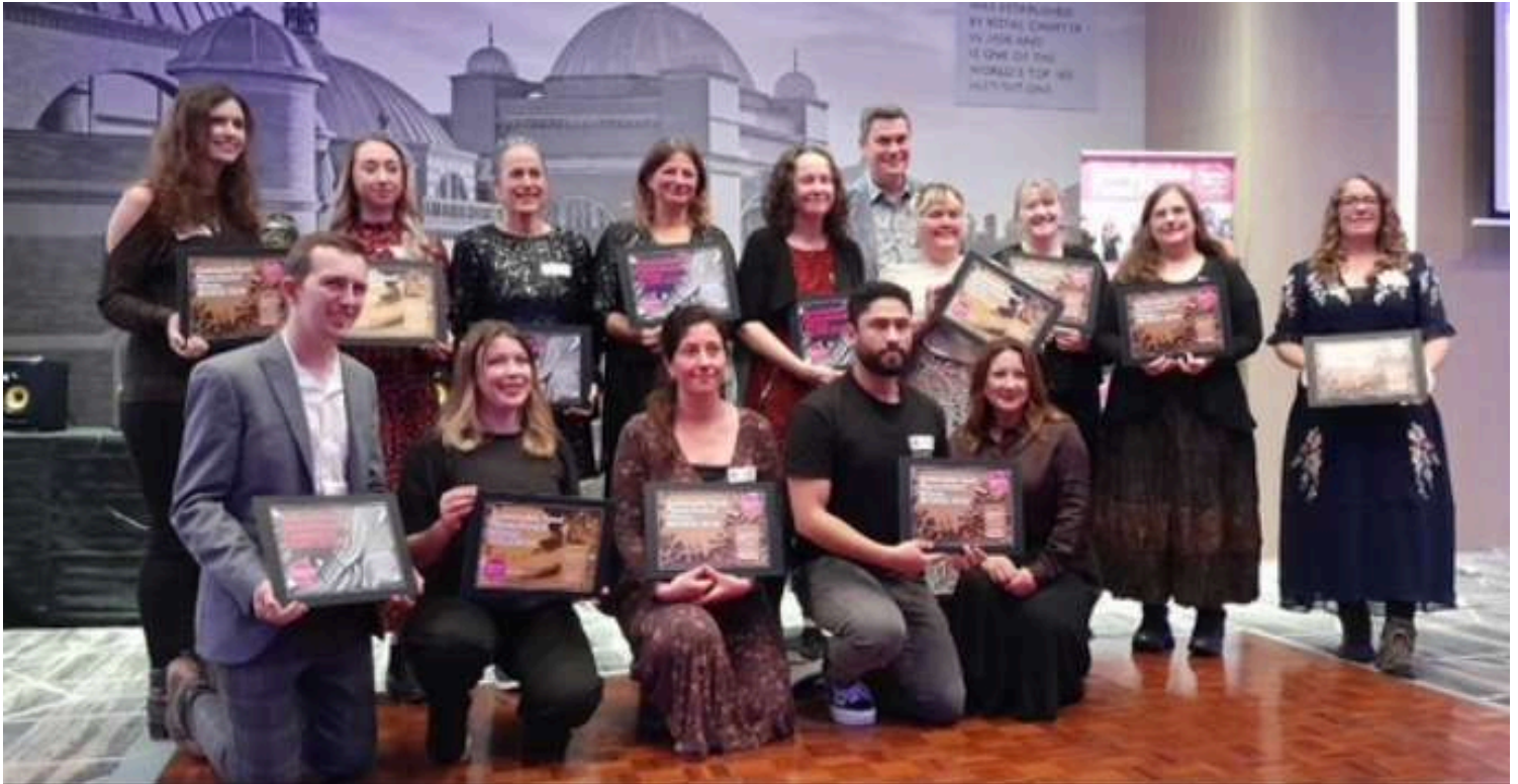
Image: Sustainable Food Places Conference, Partnership Winners (SFP, 2024)

Middlesbrough's Food Power Alliance has also played a vital role, tackling food insecurity through programs such as community kitchens, food banks, and the Healthy Start voucher scheme, which supports low-income families in accessing fresh, nutritious produce.