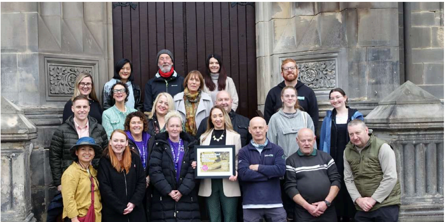
Image: Representatives of Middlesbrough Food Partnership

The Gold Award is not just a testament to Middlesbrough's commitment to sustainability, it represents a collective effort by local organisations, businesses, community groups and residents to create a healthier, more sustainable and inclusive food future. It highlights our commitment in tackling some of the most pressing social, environmental, and economic challenges, from reducing food waste to promoting healthy eating and building stronger local food economies.